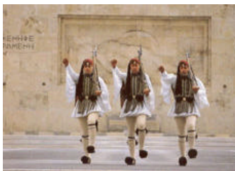
Above: The Hellenic Republic (Greece) buried an unknown soldier in Syntagma Square in 1843.