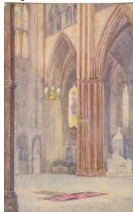
The British entombed their first unknown soldier in Westminster Abbey in 1920.