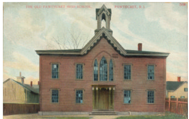
The Old Pawtucket High School Pawtucket, R. I.

Look closely at this postcard. It was never used but it is of German manufacture and has a divided back – assumptions are it is from between 1907 and 1915.