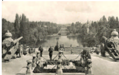
Romania's unknown warrior was buried at this site in Bucharest in 1923.