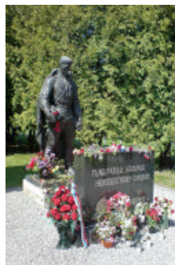
Right: Since 1916 Estonian unknowns have been at rest in the Defense Forces Cemetery in Tallinn.