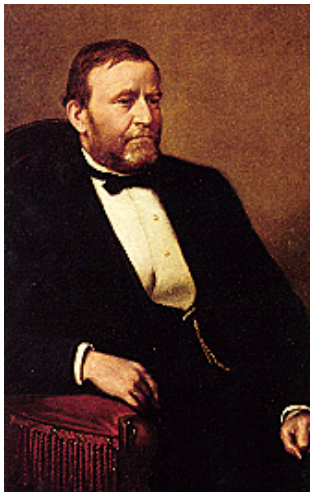
ULYSSES S. GRANT OFFICIAL WHITE HOUSE PORTRAIT

On April 9, 1865, General Grant accepted the final surrender of Confederate General Robert E. Lee at Appomattox Court House, Virginia, ending the four year long, bloody Civil War.