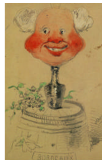
Bordeaux Caricature, 1857

Monet did this famous caricature in 1857, when he was only seventeen years old. It is unknown if he used any particular person as a model, but it is thought the face may be one of his teachers.