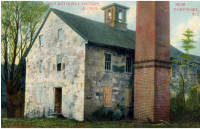
The Old Butterfly Factory, Lincoln Wood, Pawtucket, R. I.

For me, the most fun in collecting postcards is finding a dealer that you have never met before. Is it the adventure or mystery of searching a completely different inventory? I think so!!! Such was the case when I bought these cards at the King Hill Books & Old Postcards Store in Kingston, Rhode Island. The Butterfly Factory card has a special charm about it because of the message, but I will tend to the message later. First let's discover the history of the building. . .