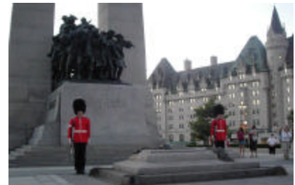
Canada's Fallen Hero lies at rest in Ottawa. King George VI presided during his visit in 1939.