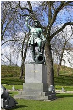
The Danish memorial to an unknown is the Landsoldaten erected in Denmark in 1858.

➤➤ Forty-two other nations have similar graves; here are a few. <<<