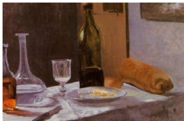
Still life with Bottle, Bread and Wine by Claude Monet

Many years later when Monet was an artist capable of creating masterpieces like this one, his passion for many of life's pleasures, especially food and wine, became evident in his work and commanded a bit more the twenty francs.