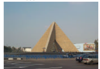
Above: At Nasr City (part of Cairo) the Egyptians have entombed soldiers who lost their lives in the October 1973 War.