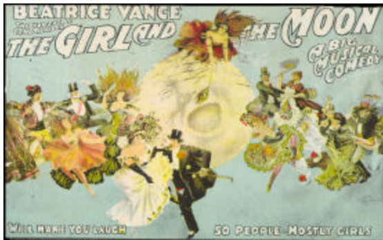
The Girl and the Moon

The title of this musical comedy, The Girl and the Moon , comes from an ancient Siberian fairy tale that recounts the story of how a very lonely moon came to earth one day and tried to spirit-away, into the sky, a young girl as a celestial companion. The attempt is a complete failure and the moon finds it must offer many timeless gifts to win the girl's forgiveness. The first literary reference dates to the 1750s.