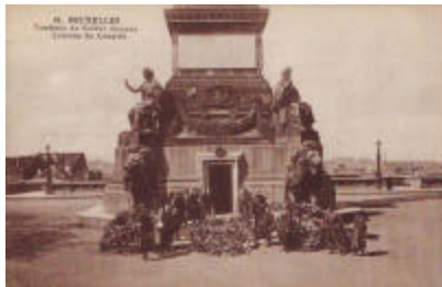
King Albert presided over the entombment of five unknown Belgian soldiers in Brussels on November 11, 1922.