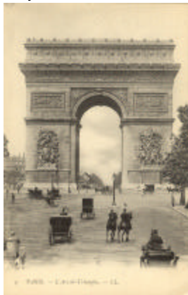
France buried a World War I unknown at the Arc de Triomphe in 1920.