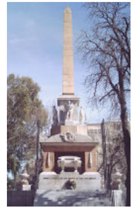
Spain laid to rest their unknown soldiers at this Obelisk on November 22, 1985.