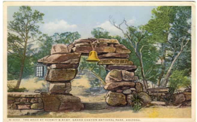
The Arch at Hermit's Rest, Grand Canyon National Park, Arizona

Imagine this. You are 31 years old. You recently graduated from the California School of Design in San Francisco where you completed your studies with honors. It is 1901 and you are a female in a profession dominated by men, but your application for a job at the Fred Harvey Company is received with a high degree of enthusiasm and you are hired the next day.