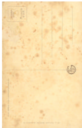
Example of Foxing on paper

The card you see here is a good example of foxing on paper. It is a term often used by collectors, but it is seldom fully understood.