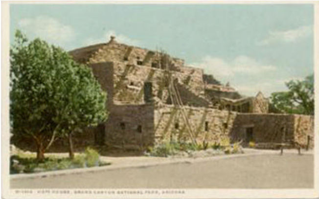
Hopi House, Grand Canyon National Park, Arizona