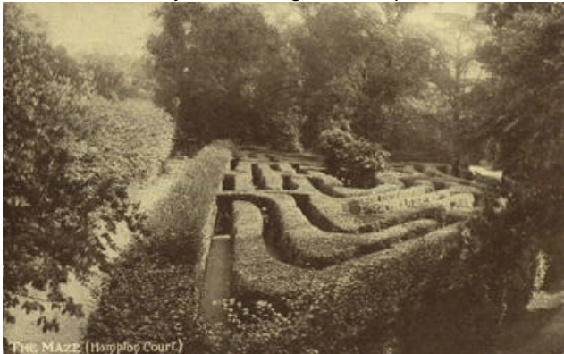
The hedge maze at Hampton Court, Richmond, England.

There are very few, but a good example of a maze on a postcard is seen below, left; and a labyrinth, right . . .