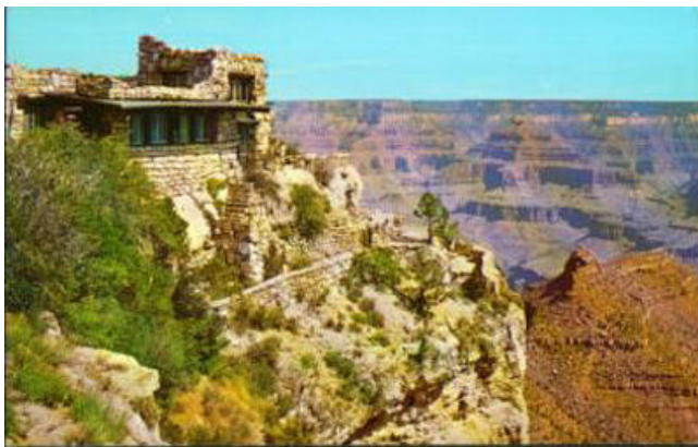
The Lookout Studio, Grand Canyon National Park, Arizona

Yes, such an accomplished career is hard to imagine, but that is exactly what happened to Mary Jane Colter (1869-1958).