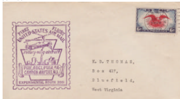
First Flight United States Air Mail rotary-wing aircraft PHILADELPHIA, PA – CAMDEN AIRPORT, NJ EXPERIMENTAL ROUTE 2001 (Postmarked at Camden, N.J., July 6, 1939)