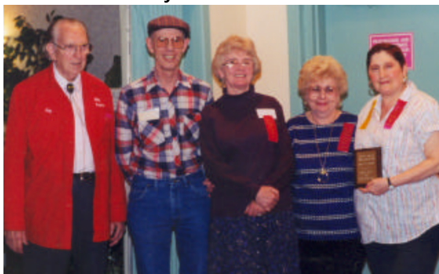
Can you identify any of these people?