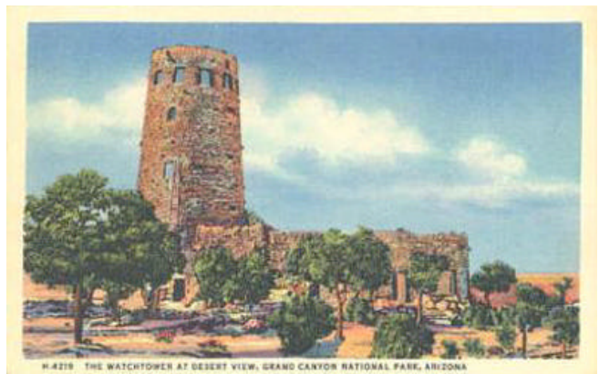
The watchtower at Desert View, Grand Canyon National Park, Arizona