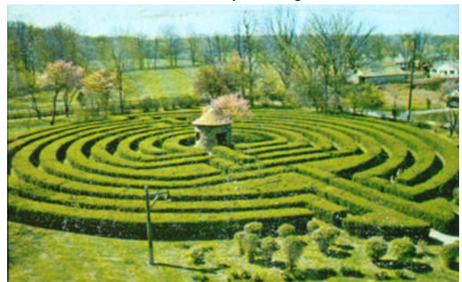
The labyrinth at New Harmony, Indiana

The maze, above left, the most famous hedge maze in the world, is situated at Hampton Court near London. It covers an area of a third of an acre, and its paths are half a mile long. One may think, by looking at the postcard that one could find this maze to be very simple, but don't be misled with its seemingly "simple" pattern; it's incredibly easy to lose yourself in this maze since the hedge is more than ten feet tall and it is nearly impossible to see through the hedge at any point. The maze was planted in the palace gardens in 1702 as an amusement for King William III, and it still attracts people from around the world. Every year thousands are happy "to be lost" in it.