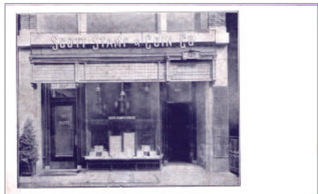
Scott Stamp & Coin Co.

At a recent postcard bourse, I was looking for postcards of New Jersey post offices. The dealer, who knew I was a philatelist, asked if I was interested in the card shown above, since it depicted a stamp and coin business. While not something I would normally collect, this was a special stamp and coin business, the New York City office of the Scott Stamp & Coin Co. By going through my old Scott catalogues, and with help from the American Philatelic Research Library, I've determined that the address was 127 Madison Ave., New York; and that the Scott Stamp & Coin Co. was at that address from 1911 to 1919.